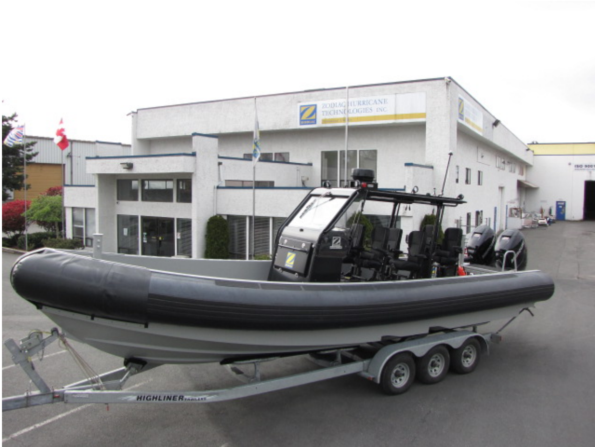
H940 OB MACH II STATIC ICE

Considered the finest craft of their type in the world, the Zodiac Hurricane range of RIBs are used by the most knowledgeable and discriminating operators who demand the utmost in ruggedness and reliability. RIBs combine the security, stability, light weight and ease of use of traditional inflatables with the speed and comfort of a rigid boat. True “go anywhere” boats, they provide exceptional marine qualities combining a low centre of gravity to a deep V hull and a stabilizing buoyancy tube.